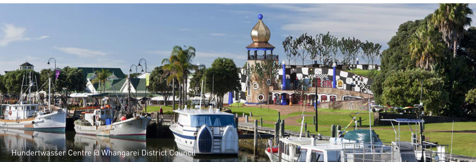
Hundertwasser Centre @ Whangarei District Council